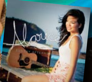
To order a CD, call 910-5524

You can learn more about Alarice and her music at www.alaricemusic.com